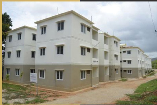
PG Setty Construction Technology Pvt Ltd - Karnataka