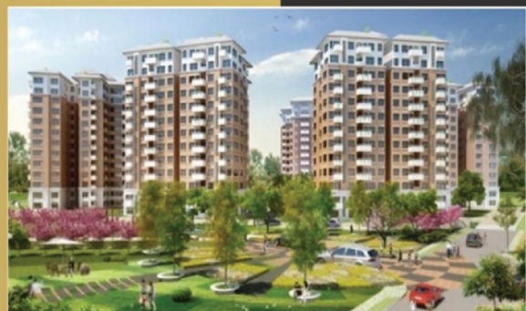
Zuari Garden City, Mysore