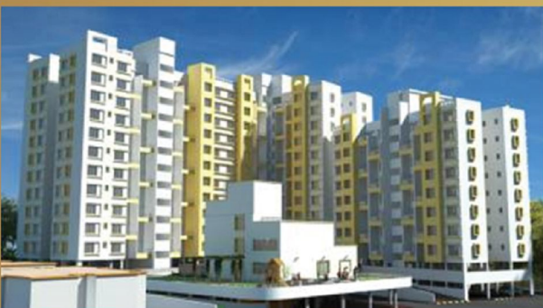
Sankalp Construction Private Limited - Mysore