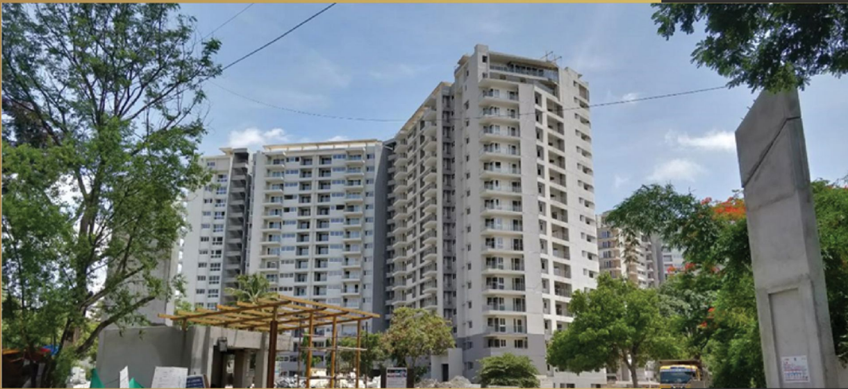
Godrej United, Bangalore