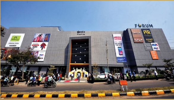
Forum Centre City Mall - Mysore