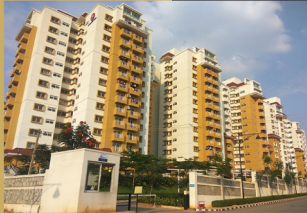
Mantri Webcity 2 - Bangalore